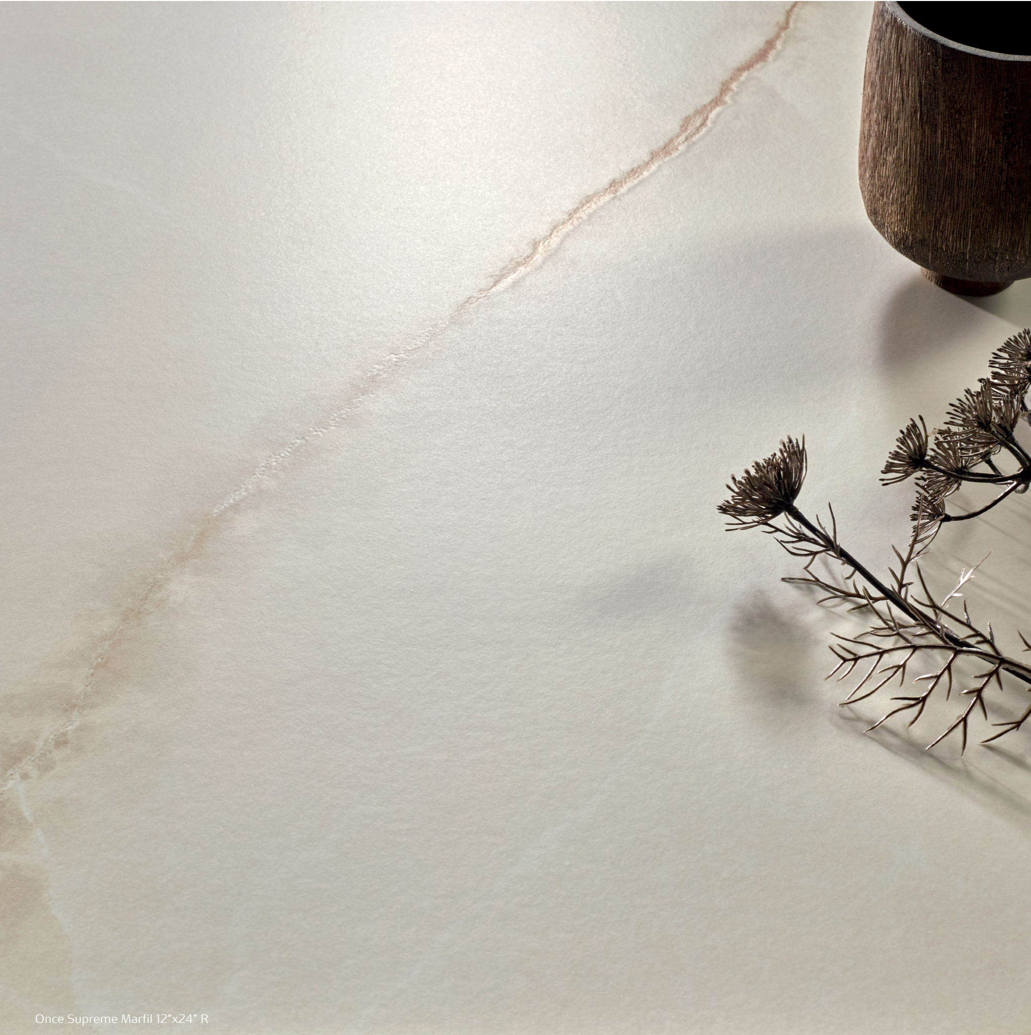
Once Supreme Marfil 12"x24" R

Onice Supreme majestically captures the essence of nature in every piece. Inspired by the sublime beauty of onyx. Its refined texture features golden veining and translucent cream tones, creating a serene, sophisticated aesthetic. This marble finish elevates any space, transforming it into a luxurious sanctuary of tranquility and grace.